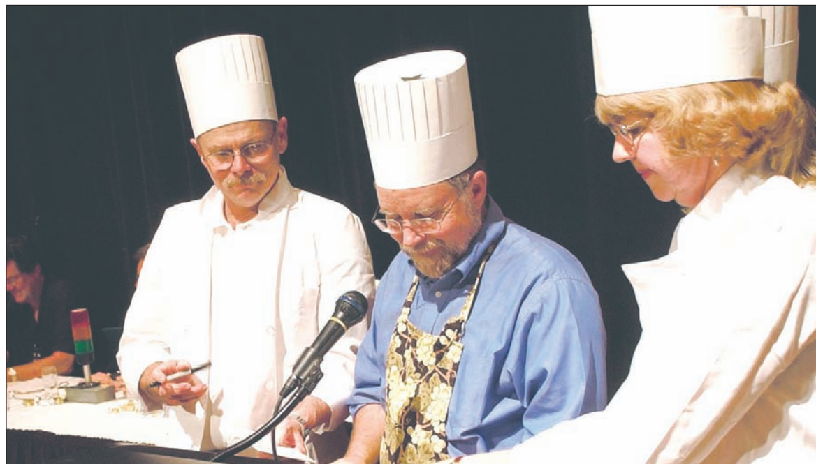
Turlock Friends compete at the Library Foundation's Adult Spelling Bee

F riends of the Library support their local branch library through advocacy and fundraising for special library needs. Anyone can join the Friends of the Library – annual membership dues are set and collected by each Friends of the Library group. Friends also hold fundraisers like used book sales to help fund special library projects: