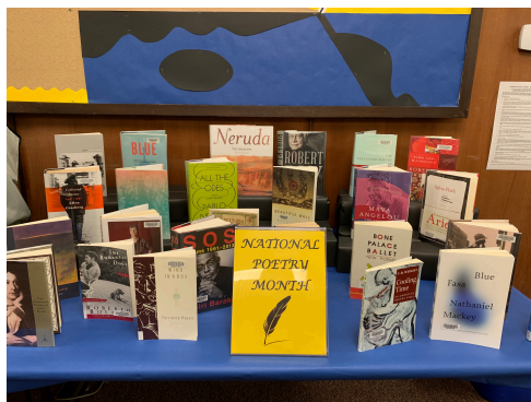
The library celebrated National Poetry Month with a table of poetry books!

We are getting monthly updates on the progress of the library project. Attend one of our meetings to hear what is happening. Our meetings are held on the first Wednesday of each month at 6:30 PM at the library.