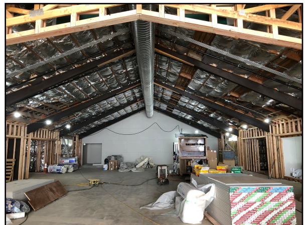
The Adult Collection.