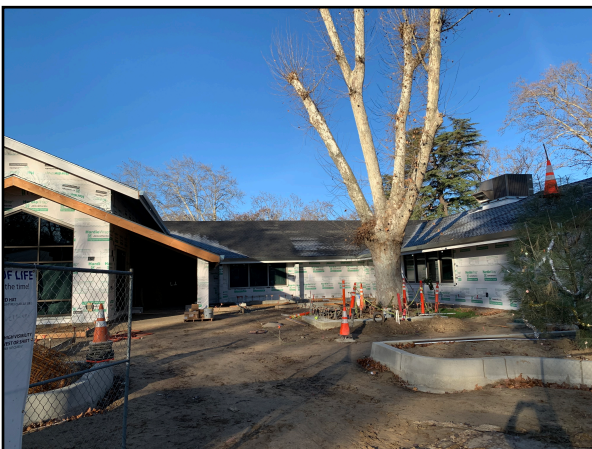
The new entrance to the Turlock Library.