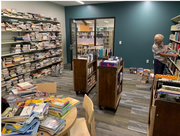
Aug. 2021 Putting the store together.