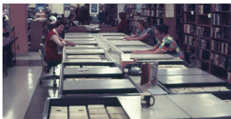
These photos from the 1970s depict activities that used to take place in the Library basement, including cataloging and home delivery services.

When the library opened in November 1971, employees must have marveled at the space. It was very different from the small behind-the-scenes work space at the old library (now the McHenry Museum).