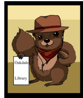
Oakdale Library's Dusty the Squirrel -Emily Slusher